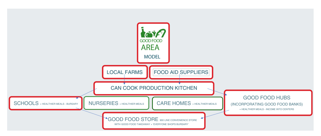
Figure 2. Good Food Area.