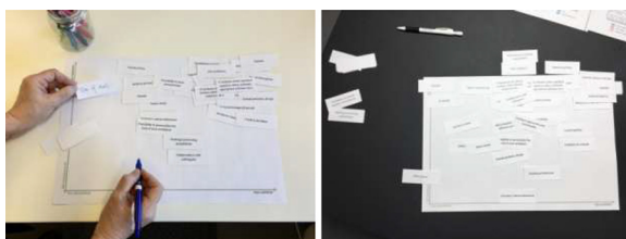
Figure 4. Examples of how the participants sorted the cards with respect to satisfaction and importance

2.3.3 Methodological insights on card sorting. Card sorting allowed for opening a dialogue space where participants could provide rich insights about pre-set themes, as well as about themes that were not considered in the planning of the study but that surfaced as relevant during the sessions. Proposing such unanticipated themes and following up with other participants, however, remains at the discretion of the interviewer and the time constraints of the programmed sessions. Further, handing the cards one by one to the participants proved to be an effective manner to help them focus on each card’s theme while allowing them to freely reflect and elaborate on how each