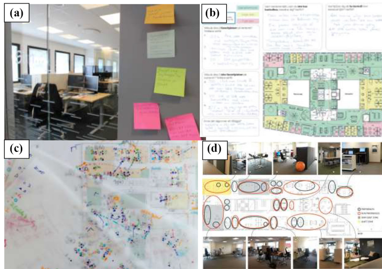
Notes: (a): In-situ walkthroughs with post-it notes; (b): In-situ walkthroughs with architectural drawings; (c): “Offline” walkthroughs with annotations on architectural drawings; (d): Synthesis of walkthroughs in one of the case studies showing preferences and non-preferences, as well as overlapping and at times conflicting preferences amongst the different participants

WT1. In-situ walkthroughs with post-it notes – A total of 32 participants marked their usage preferences and non-preferences and their motives on post-it notes during a walking tour around their offices (Figure 1(a)). This application was conducted as a part of a workshop series that was intended to identify areas of improvement. The case organisation was a public service provider that had implemented flexible offices six months prior to data collection. The participants went on a walking tour during which they showed each other their personal user preferences and left their post-it notes around the offices. After the