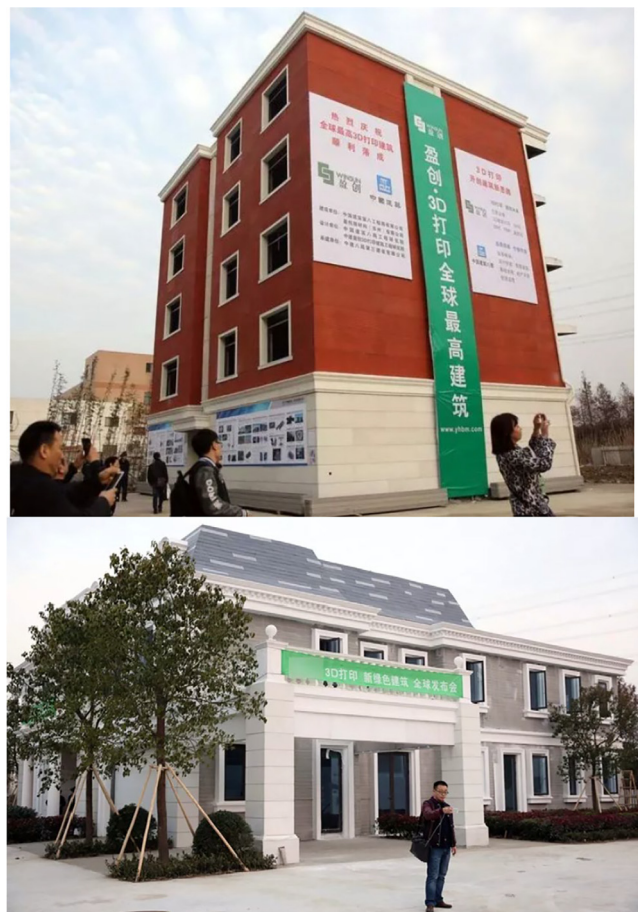
Figure 3 3D printed buildings by WinSun

Several applications of 3D printing in civil engineering have been demonstrated successfully. The Eindhoven University of Technology designed a new type of 3D printer, which can print constructions with high accuracy in 2015 (Zhang et al. , 2019). In 2016, the first multi-story building was printed using the same method, and it has been already used as the Museum of the Future in Dubai (Starr, 2016). It was printed in Shanghai by WinSun Company in 17 days. The building was shipped to Dubai and assembled in two days (Gregerson, 2016). The cost of the building was approximately US$140,000 and the area