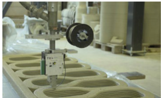
Figure 7 Material extrusion system

The mechanical properties of the longitudinal samples were close to the casting one. However, a difference was observed in the failure mode between the states, with casting parts showing a tougher behavior, whereas the 3D-printed samples exhibited high degrees of porosity. The results suggest that the novel material is suitable for 3D printing, with minor degradation observed in the process. It was found excellent layer adhesion with negligible effect on the finished part for the longitudinal orientation. It indicates, if the large-scale buildability is successful, the material is very suitable for 3D printed building