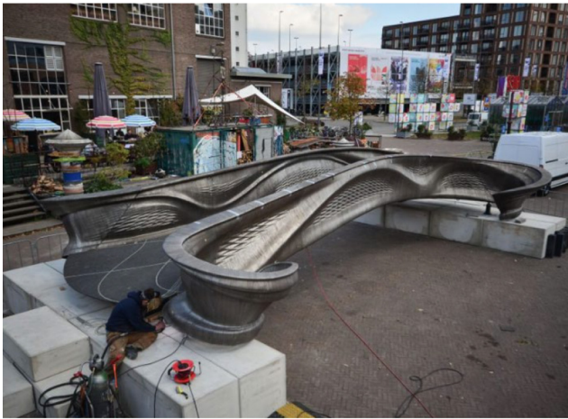
Figure 1 MX3D bridge