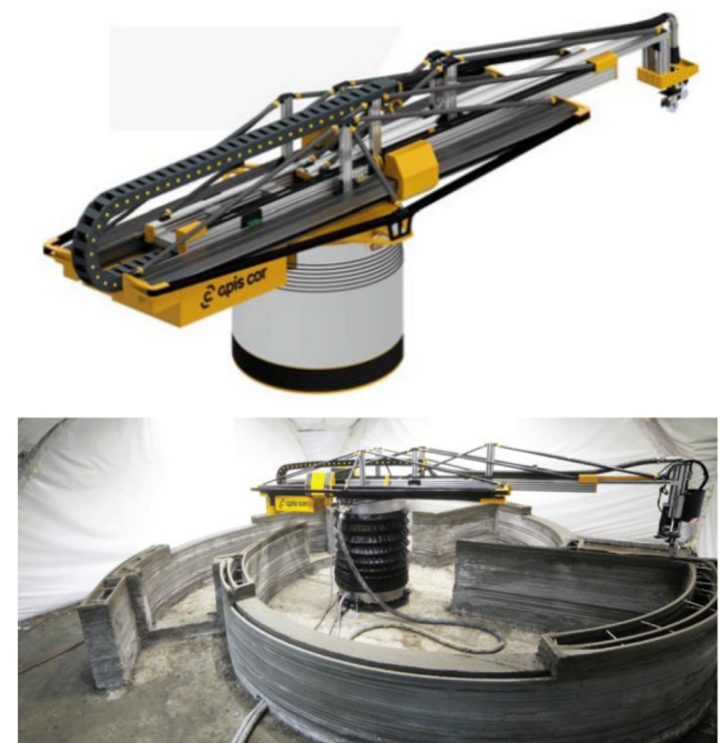
Figure 6 APIS COR 3D printer (Vatin et al. , 2017) and its application (Yin et al. , 2018)

Additive construction is a special type of 3D printing used for construction on a larger scale than traditional 3D printing. The primary material of AC is concrete materials. Printing with