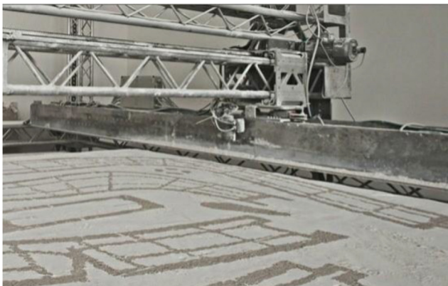
Figure 8 D-shape printing technology