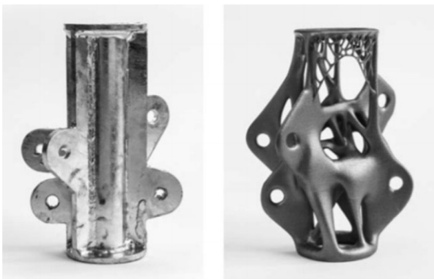
Figure 2 Node models: traditional way (left) and 3D printing method (right)

Khoshnevis and Zhang (2016) developed a new powder-based 3D printing called selective separation sintering (SSS),