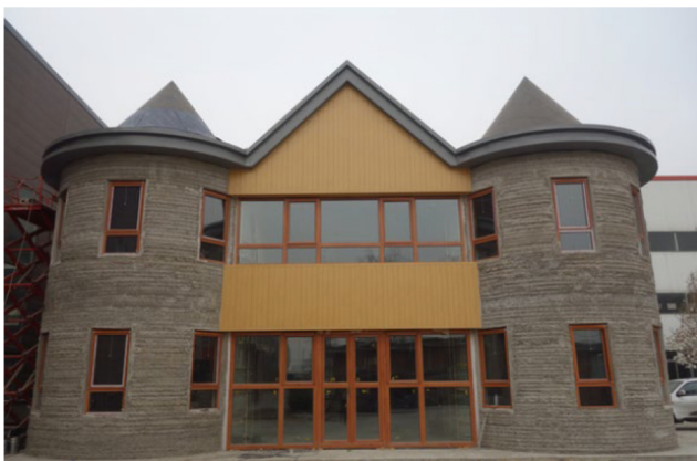
Figure 5 3D printed house by HuaShang Tengda

(Figure 6). APIS COR printer can build a construction structure from inside because of its unique design. It can remain in one spot and fabricate concrete walls layer by layer (Vatin et al. , 2017).