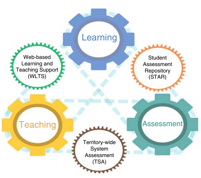
Figure 2. BCA program – STAR+TSA+WLTS