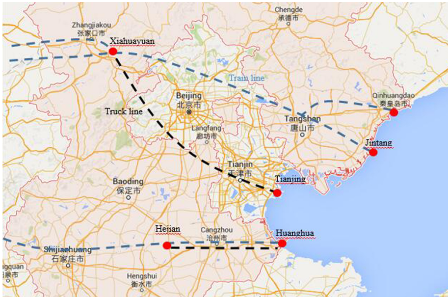
Figure 1. Coal container logistics chain in north China