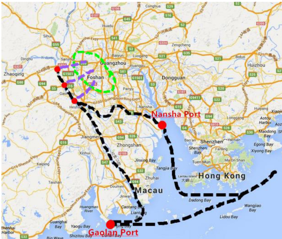
Figure 2. Coal container logistic chain in the south of China

Although the transport via container ships costs more than that by bulk ships, using containers to transport lump coal has certain advantages. According to an internal report provided by Qinhuangdao Port Group, in the process of loading and unloading, about 10 per cent of the lump coal will break into powder, which is apparently a significant loss. Also, to serve small and dispersedly distributed customers, coal container shipments work better because the just-in-time inventory management system can be of great use in reducing financing costs and inventories by ensuring a more constant flow of small tonnages. Besides, additional trailer cost will be spent by the bulk transportation because the big bulk ships cannot navigate on the Xi River and Nansha port is far away from customers. Furthermore, container transport is supposed to be less time costly than bulk transport if the scheduling and sailing speed of container liners are both taken into consideration.