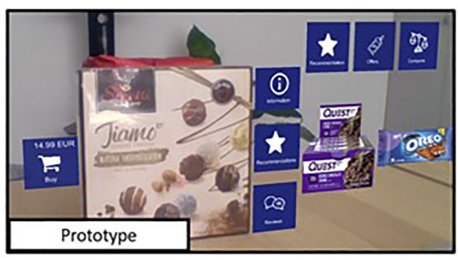
Figure 3. Demonstration of the application (left) and a prototype interface screenshot (right)