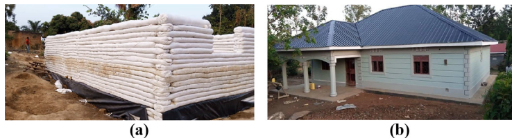
Figure 1. Typical sandbag dwelling

Prior research has shown that establishing earthbag construction codes and standards at the national and international levels is crucial for the widespread adoption of earthbag