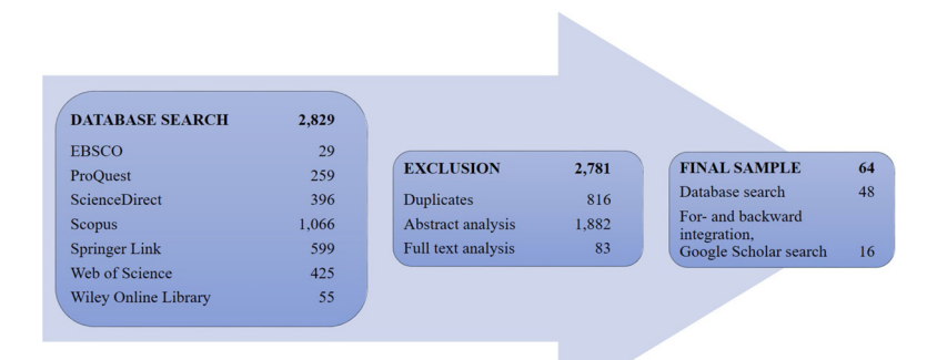
Figure 3. Selection process

After determining the final sample, we started to analyze the publications as suggested by Massaro et al. (2016) and Tranfield et al. (2003). Similar to prior reviews in the field of business and management (Senftlechner and Hiebl, 2015), studies that contain "more" information regarding our research focus were regarded as "richer" and are more often cited.