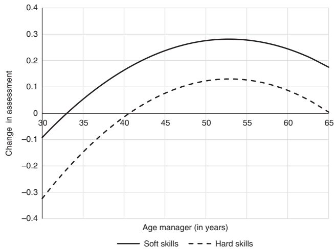
Note: Simulated curves are based on estimated coefficients in Table III