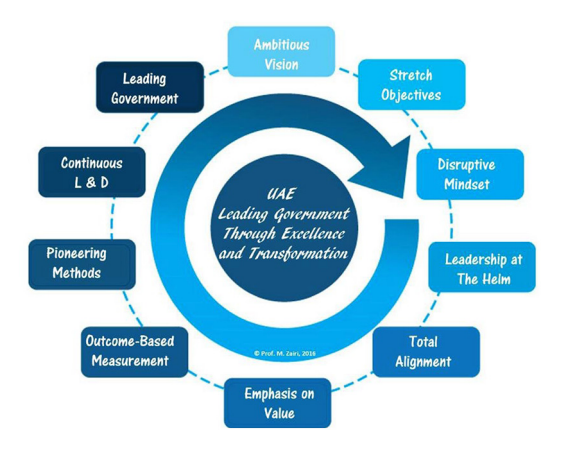
Figure 2. Principles of the UAE GEM

The GEM presents the development of an ambitious vision for influential and positive future governments through creating an integrated government structure of synergy and