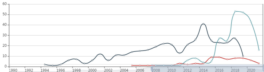
Figure 2. Distribution of the number and time of academic ecological governance papers from 1990 to 2021

The core viewpoints of each academic paper are expressed by keywords, which cover the important contents of the paper theme. Therefore, the analysis of keywords in a certain field would quickly dig out the research viewpoints and contents in this field. With the literature metrology software, two keywords, "academic ecology" and "academic ecological environment" are explored in depth. All the literature data are imported into the software and the time span is set from 1989 to 2021. The length of a single time partition is 1a, the source of clustering words is "title," "abstract," "author keywords" and "keywords plus" and "burst plus" as clustering type, the "keywords" as node type. As the number of selected