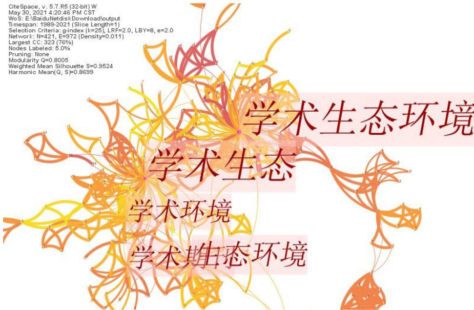
Figure 3. Structure diagram of keywords in academic ecological environment research field from 1989 to 2021

Two hot topics on the academic ecological environment issue are obtained through literature metrology software. One is the current situation of the academic ecological environment, the other is the governance of academic ecology. Obviously, both of these problems have affected the conservation and development of an academic ecological environment in China. Academic environment is the life foundation for the academy (Ji, 2015). The collection of environmental conditions of academic activities constitutes the academic ecological environment (Li, 2007). With the continuous emphasis on academic research in universities