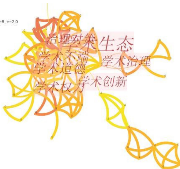
Figure 4. Structure diagram of keywords in academic ecological environment governance research field from 1990 to 2021

CiteSpace, v. 5.7.R5 (32-bit) W May 30, 2021 4:10:57 PM CST WoS: E:\Baidu\Netdisk\Download\output Timespan: 1990-2021 (Slice.Length=1) Selection Criteria: g-index (k=25), LRF=2.0, LBY=8, e=2.0 Network: N=207, E=422 (Density=0.0198) Largest CC: 109 (52%) Nodes Labeled: 5.0% Pruning: None Modularity Q=0.8666 Weighted Mean Silhouette S=0.9805 Harmonic Mean(Q, S)=0.9201