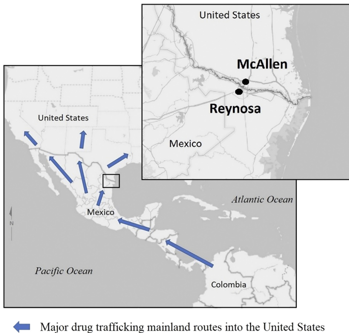
Figure 1. Map of the border region in the study