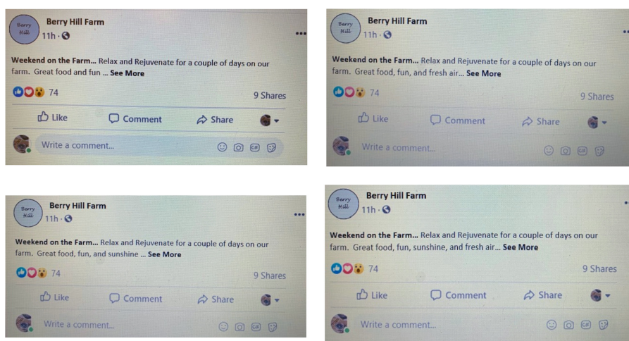
Figure 1. Experimental treatments: Facebook posts

While research related to fresh air often pertains to the treatment of illness (e.g. Hobday and Cason, 2009; Strange, 1991), it is prudent to recognize that fresh air has a host of benefits in healthy individuals as well. Nowadays, there is a wide range of exercises in fresh air, also called green exercises that generate health benefits. These activities include walking, cycling, horseback riding, woodland activities, fishing, etc. (Pretty et al., 2005, 2007). Such activities conducted in nature-based settings are known to improve physical (Gebhard, 2014;