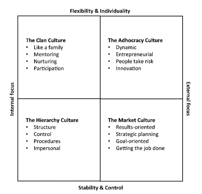
Figure 1. Four culture types related to competing values framework

Source: based on Hooijberg and Petrock (1993)