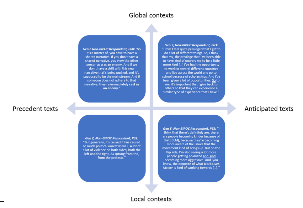
Figure 2. Intertextual analysis BIPOC respondents

The upper left quadrant represents how social identities are constructed. In this case, those that are viewed to not share the narrative of BLM are considered "enemies". The participant is demonstrating the limits of his/her identity in relation to BLM based on interpretations of what is perceived to be "mainstream". The lower left quadrant considers how parts of known narratives are incorporated. Here the participant uses the familiar Former President Trump's nullifying text of violence occurring on "both sides". This incorporation of historicity illustrates how narratives are onboarded and reproduced, seemingly without introspection. The upper right quadrant considers the audience of the text and here the participant takes great pains to demonstrate their position and associated actions to non-specified racialized individuals in the same vein of White saviorism.