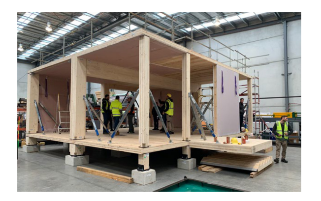
Figure 4. Completed prototype

The data provided by the tracking tests reveal the significant potential for future development of construction tracking. As noted, an integrated and industrialized construction mindset demands an emphasis on continual improvement of both product and process. While the importance of data in manufacturing processes is widely acknowledged, the construction sector has a poor legacy when it comes to data capture. The case study tests