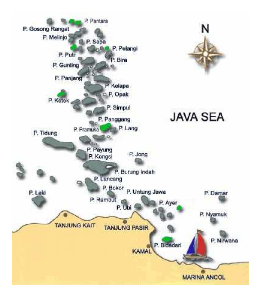
Figure 1. The Map of Kepulauan Seribu