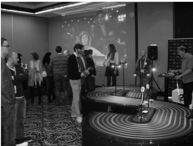
Plate 1. “Expressing competition through Scalextric, Promax UK, 2012”, photo by authors