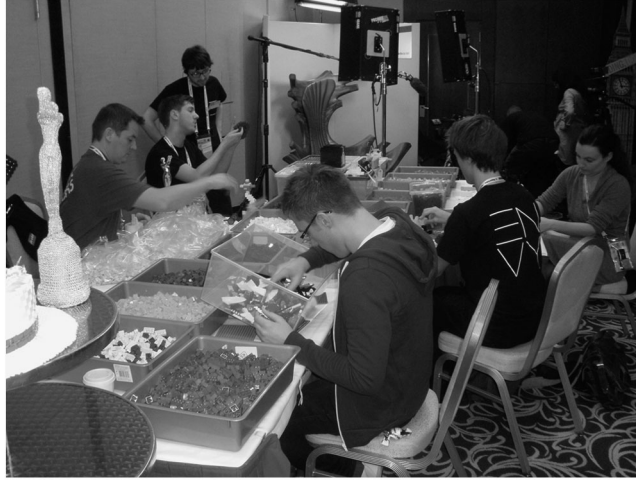
Plate 2. “Expressing creativity through Lego, Promax UK, 2012”

marketing and promotion as distinctly uncreative sectors of the cultural industries. For instance, media scholars like Georgina Born (2004) have argued that the introduction of marketing to the BBC in the 1990s offered a threat to creativity, particularly when used “to batten down and curtail the particular and expansive imaginative engagement required by good programme-making” (p. 301). Laments about creative imagination, or its lack thereof, extend to popular representations of television marketing. Also focusing on the BBC, the satirical television comedy W1A (2014) lampoons the brand obsessions of the Corporation in the early 2010s and the inane efforts by marketing and PR consultants to update and “app-ify” the BBC’s logo[4]. Rather than depict promotional work as a professional discipline requiring creative acumen, marketing is seen in these portraits as limiting and vacuous in creative and imaginative terms.