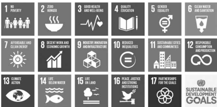
Fig. 8.1. The SDGs.

They extend from goals relating to the natural world and our interaction with it, for example Goal 13: Climate Action , Goal 14: Life Below Water and Goal 15: Life on Land , to those which focus predominantly on human systems, such as Goal 1: No Poverty or Goal 4: Quality Education . As such, the goals range across the human–nature continuum and should play a role in understanding and fostering socio-ecological resilience as outlined by Folke et al. (2016) above. The intention of the SDGs is to outline the processes through which human activity will become more sustainable, with fewer pressures on natural earth systems, with a desire to possibly even bolster their health and quality. The goals are intended to be used as overarching principles at country and authority levels, to allow politicians to understand the overall directions of change they have agreed to follow in ameliorating the present crisis position we find ourselves in. Some sectors have