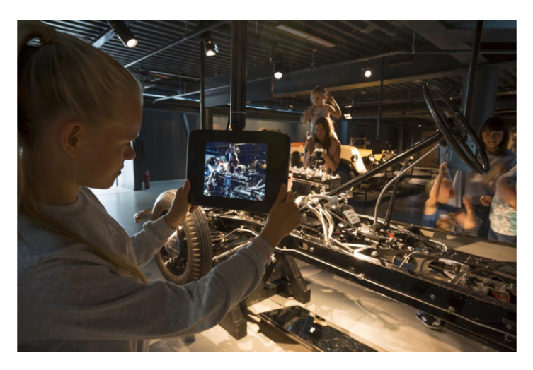
Figure 13.1. Riga Motormuseum – How the Engine Works.