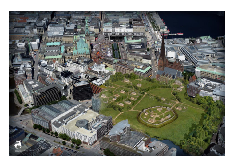
Figure 13.2. Hamburg Today Meets the Eighth Century Hammaburg Fortress.

ongoing cooperation project between Archäologisches Museum Hamburg, HafenCity University Hamburg and ICT cluster Hamburg@work companies. A result of the previous thematic cooperation with Google, a virtual exhibition of the site, titled 'Hammaburg and the Beginnings of Hamburg', is already available as a bilingual app for Android smartphones. This experience shows that the institutions of the tourism sector that have collaborated with the AV media sector are trying to find opportunities for new