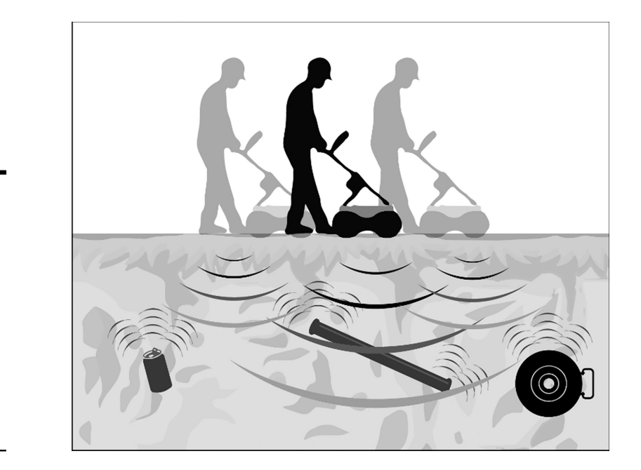
Figure 1. GPR survey.